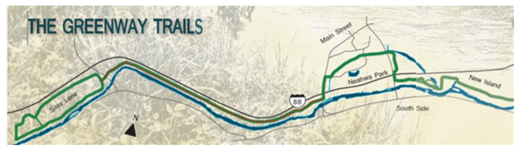
*Note: the red dotted line between Silas Lane and Neawha Park is still in the planning phase.

The Silas Lane Trail: From I-88, take Exit 13. Turn towards the mountains rather than the city, then take a right onto Silas Lane. Access the trail from either the official OSG parking lot (on the right) or the soccer field parking lot, near the end of the road.